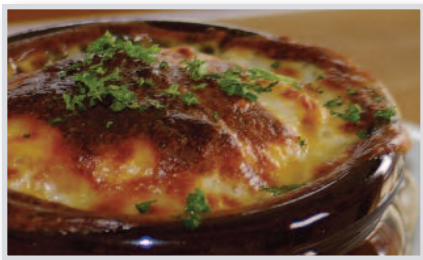
French Onion Soup