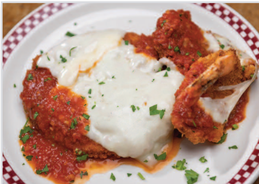
Chicken & Shrimp Combo Parmigiana

Chicken & Shrimp Combo Parmigiana Topped with marinara sauce & melted mozzarella, served with spaghetti 29.95