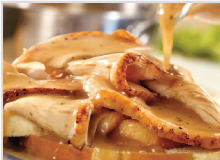
Hot Open Turkey Sandwich

(N.Y. strip) served on a garlic roll with lettuce, tomato & french fries 23.95