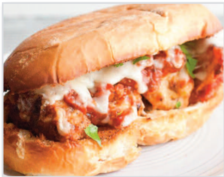
Chicken Parmigiana Sandwich