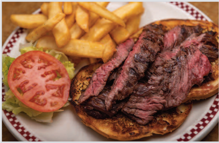
Open Steak Sandwich