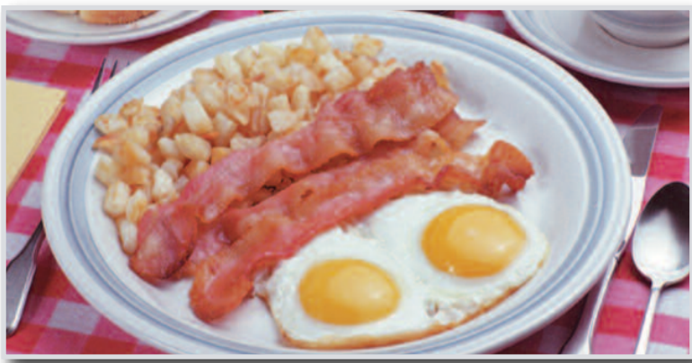
Bacon & Eggs