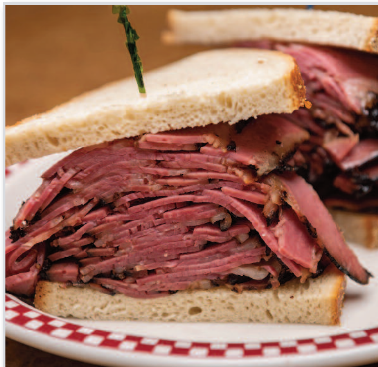
Overstuffed Pastrami Sandwich

Topped with raw onions & cheddar cheese, served in a freshly baked bread bowl 12.95