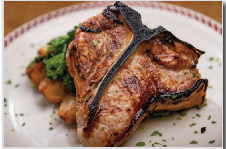
Porterhouse Veal Chop