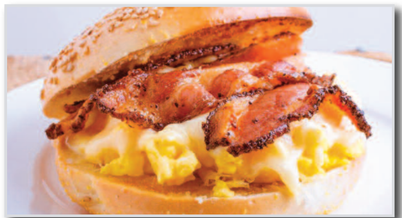
Bacon, Egg & Cheese