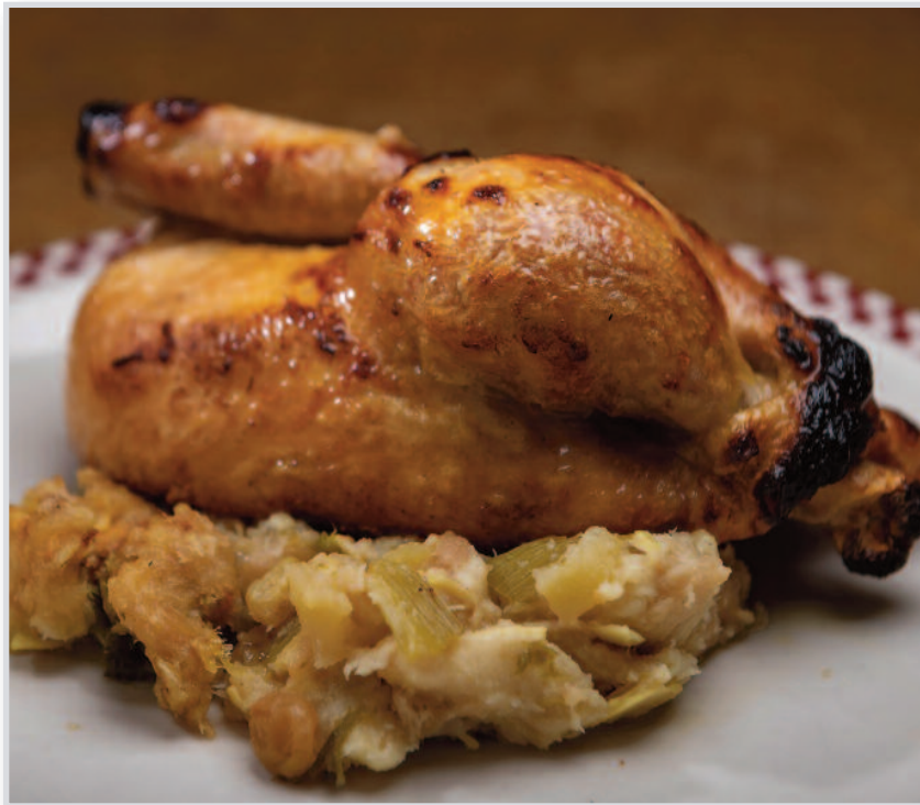
Half Roasted Chicken