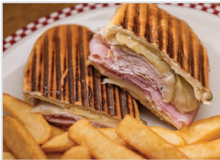
Pressed Cuban Sandwich

Medium rare roast beef on a hero with natural gravy 17.95