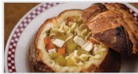
Bread Bowl Soup

Homemade soup served in a freshly baked bread bowl 7.50