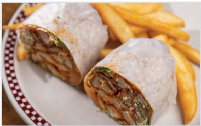
Buffalo Chicken Wrap

Fresh mozzarella, roasted peppers, spinach, carrots, eggplant & zucchini 17.95