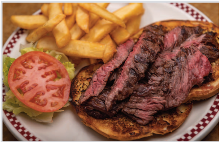
Open Steak Sandwich

Lettuce, tomato, onion, cucumber, oregano, feta & pitted olives, tossed with oil & vinegar 8.95